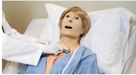
Normal and abnormal airway, heart, lung, and bowel sounds