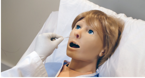
Supports nasogastric feeding and suctioning using real fluids